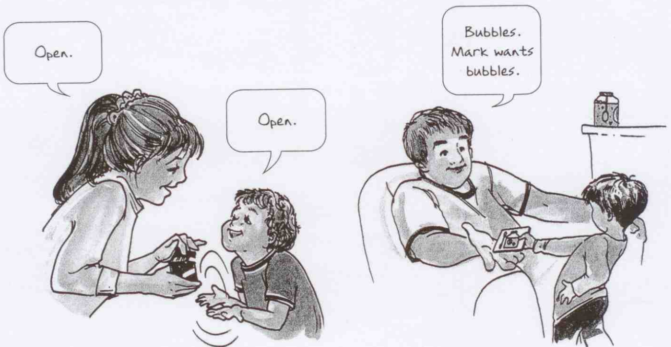
Jake makes a hand sign and repeats the word "open" to ask for raisins.

The Early Communicator has started to use specific gestures, sounds, pictures or words to ask for things in very motivating situations, like requesting favourite foods or toys.